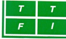
TABLE TENNIS FEDERATION OF INDIA